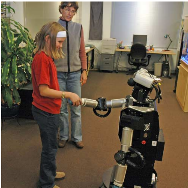
Figure 1. Initial Introduction Design Pattern

Robovie to participant: “How are you today?”