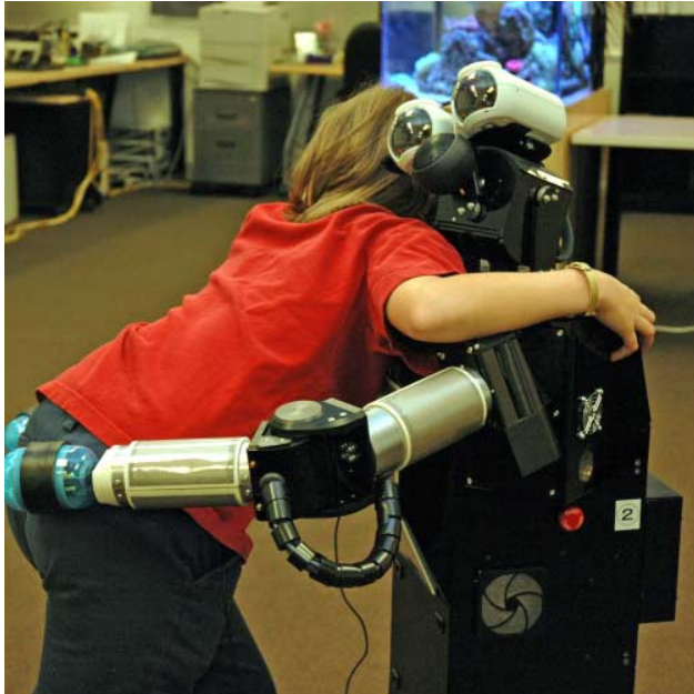
Figure 3. Physical Intimacy Design Pattern

game. I had fun. Will you give me a hug?" Robovie then opens up its arms. When the participant begins to engage in the hug, Robovie tilts its head and gently puts its arms around the participant.